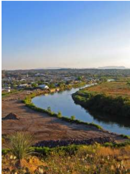
The Rio Grande looking east

Man-made reservoir created by Caballo Dam to hold water released from Elephant Butte Lake for use in generating electricity and for irrigation purposes. Barren rocky desert mountains arise on the east side of the lake. Legends speak about treasures hidden in these mountains by outlaws of bygone days.