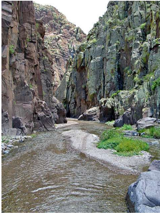
Monticello Box Canyon