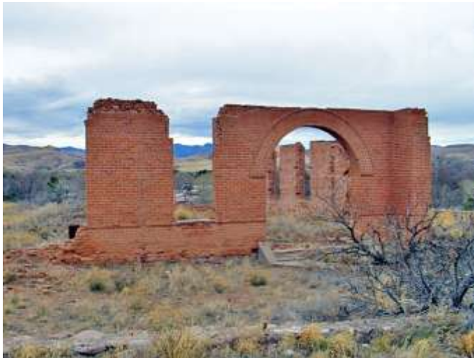
Ruins of old Sierra County Courthouse

Miners were the next wave of immigration into the area after gold and silver was discovered in the Black Range in the 1880's. The communities of Hillsboro, Kingston, Lake Valley, Chloride and Winston sprang up along with several smaller towns that flourished for a few years then were abandoned when the silver market died. The population grew and a new county was formed in 1884, named Sierra. Hillsboro had the honor of being chosen as the county seat. This beautiful little town still boasts some stately old homes along the tree-lined main street, and other historic buildings. The ruins of the original county courthouse sits on the hill above the town.