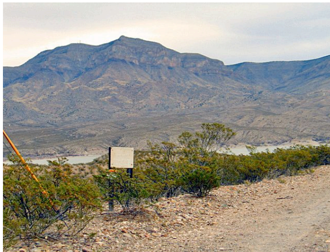
View of Caballo Mountains and Lake from Hwy 187 near junction NM 152

Beginning at the Geronimo Springs Museum in Truth or Consequences (T or C), New Mexico, the GTNSB travels west through Williamsburg and south on NM 187 following the Rio Grande. The barren peaks of the Caballo Mountains stand sentinel over the valley below, and the shimmering waters of Caballo Lake can be seen at the junction with NM 152.