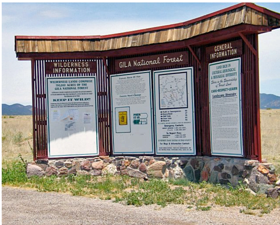
Informational display board near Hwy junctions 52 & 59