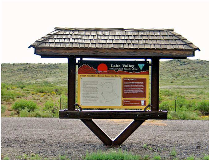
Lake Valley Informational Kiosk at Lake Valley